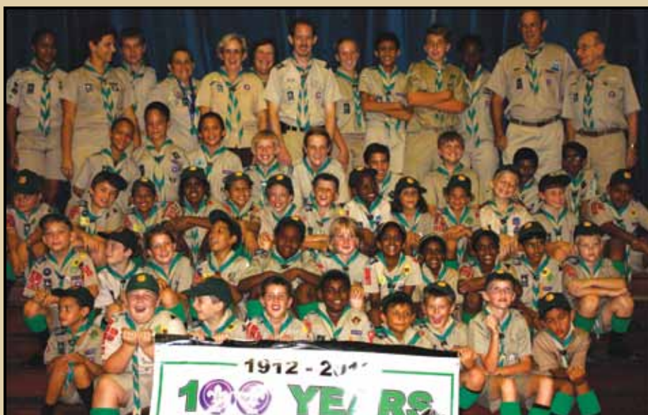
4th Durban scouts and cubs now, April 2012.